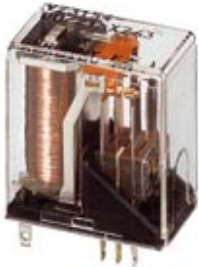
KAMMRELAIS ®, contact F 104, size 2, heavy-duty contact, 2 PDTs, input voltage 120 V AC

Please be informed that the data shown in this PDF Document is generated from our Online Catalog. Please find the complete data in the user's documentation. Our General Terms of Use for Downloads are valid ( http://phoenixcontact.com/download )