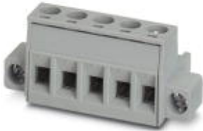
The figure shows a 5-pos. version of the product in gray

Plug component, Nominal current: 12 A, Rated voltage (III/2): 320 V, Number of positions: 17, Pitch: 5.08 mm, Connection method: Screw connection, Color: pastel green, Contact surface: Tin