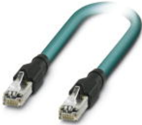
Patch cable, CAT5e, 4-pair, shielded, line, assembled at both ends with straight RJ45/IP20 heads, length: 1 m

Please be informed that the data shown in this PDF Document is generated from our Online Catalog. Please find the complete data in the user's documentation. Our General Terms of Use for Downloads are valid ( http://download.phoenixcontact.com )