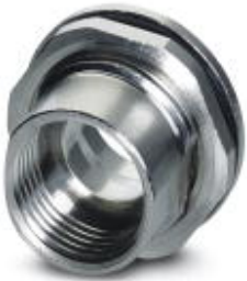
Housing screw connection, Socket, M12, Rear mounting, M15 x 1

Please be informed that the data shown in this PDF Document is generated from our Online Catalog. Please find the complete data in the user's documentation. Our General Terms of Use for Downloads are valid ( http://phoenixcontact.com/download )