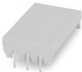
Component housing, length: 120.6 mm, Cover, color: light gray, width: 75.9 mm, height: 57.7 mm

Please be informed that the data shown in this PDF Document is generated from our Online Catalog. Please find the complete data in the user's documentation. Our General Terms of Use for Downloads are valid ( http://phoenixcontact.com/download )