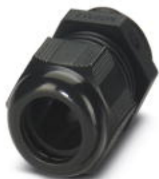
Cable gland, cable gland material: PA, external cable diameter 3 mm ... 6.5 mm, shielding: no, connecting thread: Pg7, color: jet black RAL 9005

Please be informed that the data shown in this PDF Document is generated from our Online Catalog. Please find the complete data in the user's documentation. Our General Terms of Use for Downloads are valid ( http://phoenixcontact.com/download )