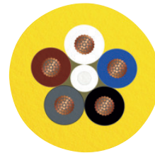
PVC yellow 105 °C [542]