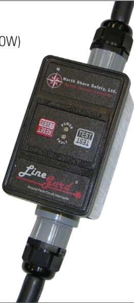
Flying Leads (SE00W)