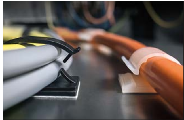
Self-adhesive one piece fixing clips RB20 (l) and RB14 (r).