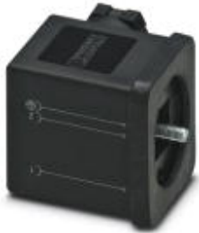
Valve connector, 3-pos., construction A, without protective circuit, screw connection, M16 cable gland

Please be informed that the data shown in this PDF Document is generated from our Online Catalog. Please find the complete data in the user's documentation. Our General Terms of Use for Downloads are valid ( http://download.phoenixcontact.com )