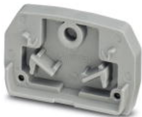
End cover, length: 32 mm, width: 4 mm, height: 20 mm, color: gray

Please be informed that the data shown in this PDF Document is generated from our Online Catalog. Please find the complete data in the user's documentation. Our General Terms of Use for Downloads are valid ( http://phoenixcontact.com/download )