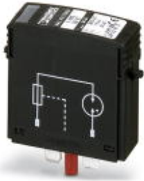
Surge protection plug type 2, with N-PE total current spark gap for base element.

Please be informed that the data shown in this PDF Document is generated from our Online Catalog. Please find the complete data in the user's documentation. Our General Terms of Use for Downloads are valid ( http://phoenixcontact.com/download )