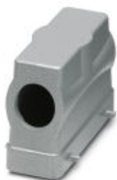
HEAVYCON B24 sleeve housing, for double locking latch, height: 76 mm, with 1 x M32 thread, lateral cable outlet

Please be informed that the data shown in this PDF Document is generated from our Online Catalog. Please find the complete data in the user's documentation. Our General Terms of Use for Downloads are valid ( http://phoenixcontact.com/download )