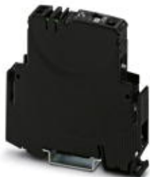
Electronic circuit breaker, signal contact: 1 N/C contact, nominal current: 10 A

Please be informed that the data shown in this PDF Document is generated from our Online Catalog. Please find the complete data in the user's documentation. Our General Terms of Use for Downloads are valid ( http://phoenixcontact.com/download )