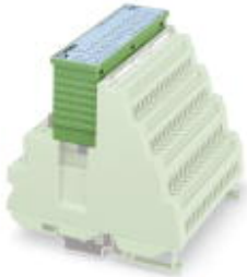
Replacement module electronics for IB ST (ZF) 24 BAI 8/I

Please be informed that the data shown in this PDF Document is generated from our Online Catalog. Please find the complete data in the user's documentation. Our General Terms of Use for Downloads are valid ( http://phoenixcontact.com/download )