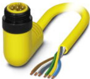
Power cable, 6-position, PVC, yellow, Plug angled 7/8"-16UNF, on free cable end, cable length: 10 m

Please be informed that the data shown in this PDF Document is generated from our Online Catalog. Please find the complete data in the user's documentation. Our General Terms of Use for Downloads are valid ( http://phoenixcontact.com/download )