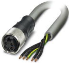
Power cable, 5-pos., gray PUR/PVC, 2.5 mm 2 , free cable end to straight 7/8" 16UNF socket, length: 10.0 m

Please be informed that the data shown in this PDF Document is generated from our Online Catalog. Please find the complete data in the user's documentation. Our General Terms of Use for Downloads are valid ( http://download.phoenixcontact.com )