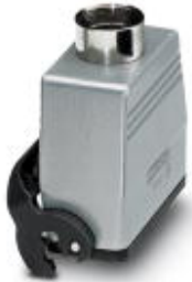
HEAVYCON coupling housing B16, with single locking latch, height 80 mm, with support 1x Pg29

Please be informed that the data shown in this PDF Document is generated from our Online Catalog. Please find the complete data in the user's documentation. Our General Terms of Use for Downloads are valid ( http://download.phoenixcontact.com )