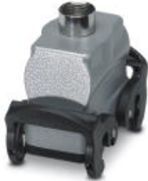
HEAVYCON B10 coupling housing, with double locking latch, height: 77.5 mm, with 1 x Pg29 gland, straight cable outlet

Please be informed that the data shown in this PDF Document is generated from our Online Catalog. Please find the complete data in the user's documentation. Our General Terms of Use for Downloads are valid ( http://download.phoenixcontact.com )