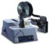
Electrical crimping tool

Electrical crimping tool - SF-Z0032 - 1607462