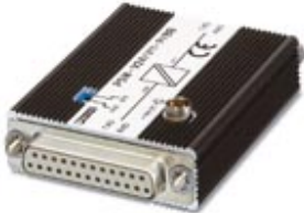
Interface converter, for converting RS-232 (V.24) to RS-422 (V.11), with galvanic isolation

Please be informed that the data shown in this PDF Document is generated from our Online Catalog. Please find the complete data in the user's documentation. Our General Terms of Use for Downloads are valid ( http://phoenixcontact.com/download )