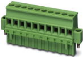
The figure shows a 10-position version of the product

Plug component, Nominal current: 12 A, Rated voltage (III/2): 320 V, Number of positions: 19, Pitch: 5 mm, Connection method: Screw connection, Color: green, Contact surface: Tin