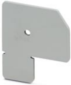
Separating plate, Width: 2 mm, Number of positions: 0, Color: gray

Please be informed that the data shown in this PDF Document is generated from our Online Catalog. Please find the complete data in the user's documentation. Our General Terms of Use for Downloads are valid ( http://download.phoenixcontact.com )