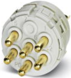
Contact insert, Number of positions: 6, Type of contact: Male connector, Solder connection

Please be informed that the data shown in this PDF Document is generated from our Online Catalog. Please find the complete data in the user's documentation. Our General Terms of Use for Downloads are valid ( http://phoenixcontact.com/download )